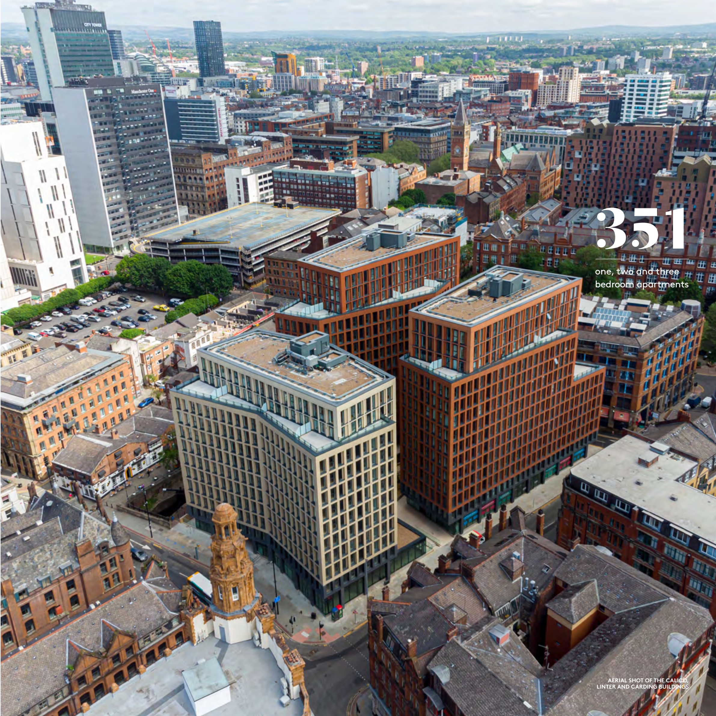
AERIAL SHOT OF THE CALICO, LINTER AND CARDING BUILDINGS

351 one, two and three bedroom apartments