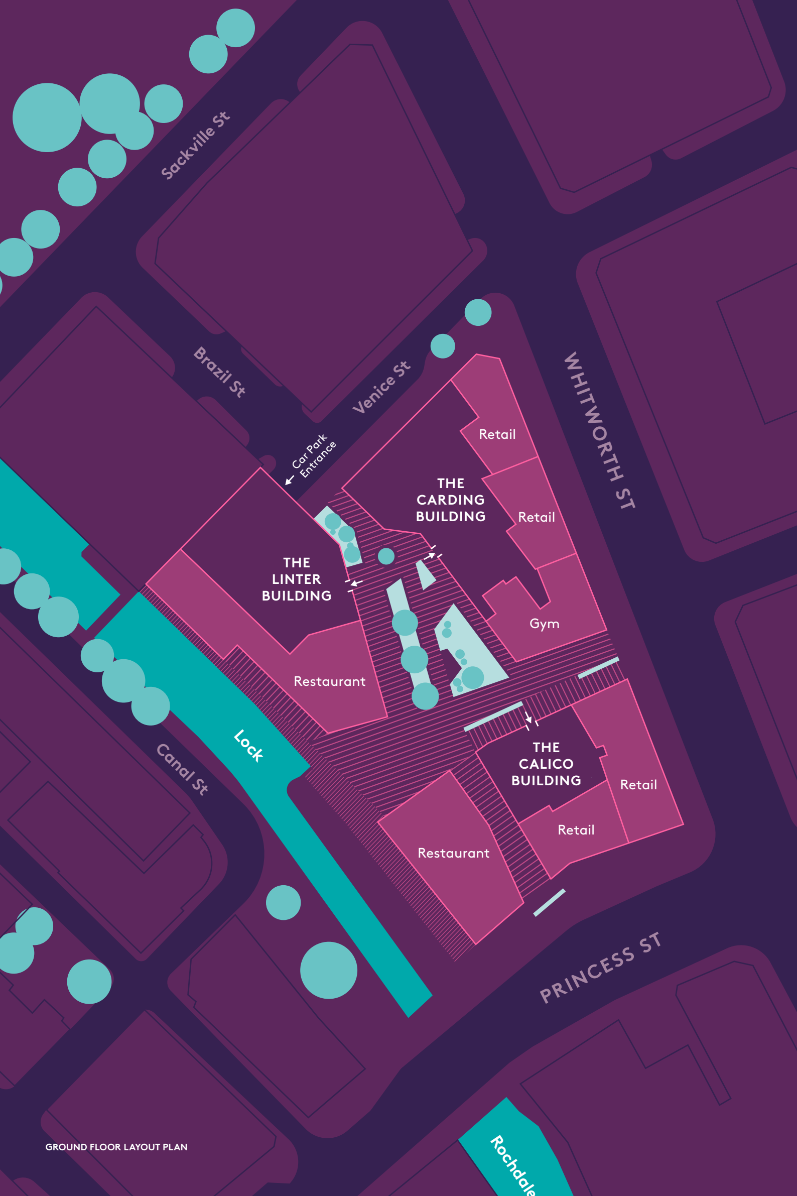
GROUND FLOOR LAYOUT PLAN

The development is positioned in the beating heart of Manchester's central community.